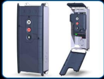
3 Phase Inverter Control Panel & Interior