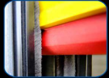
Double Brush Seal