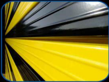
85mm Aluminium Ribbed Insulated Lath