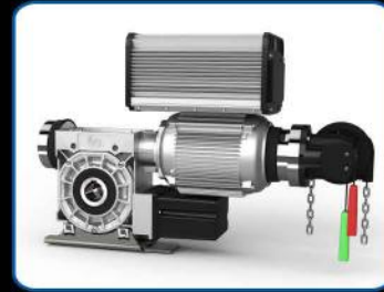
Direct Drive Motor