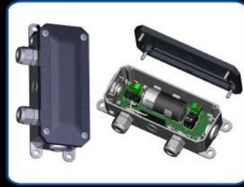
Wireless Remote Safety Edge Transmitter & Interior